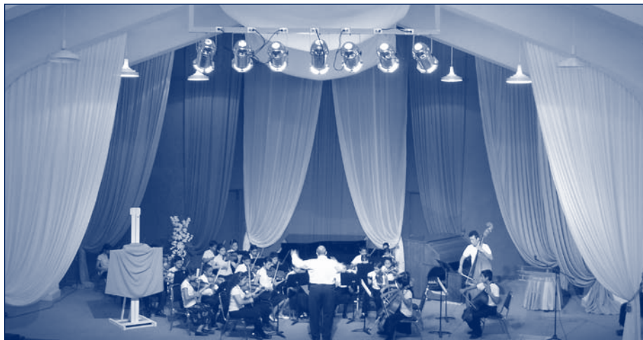
The Sonare orchestra plays in the newly renovated music auditorium on Thursday evening

taught in the department in it earliest years for eight years at two different times, was remembered and honored.