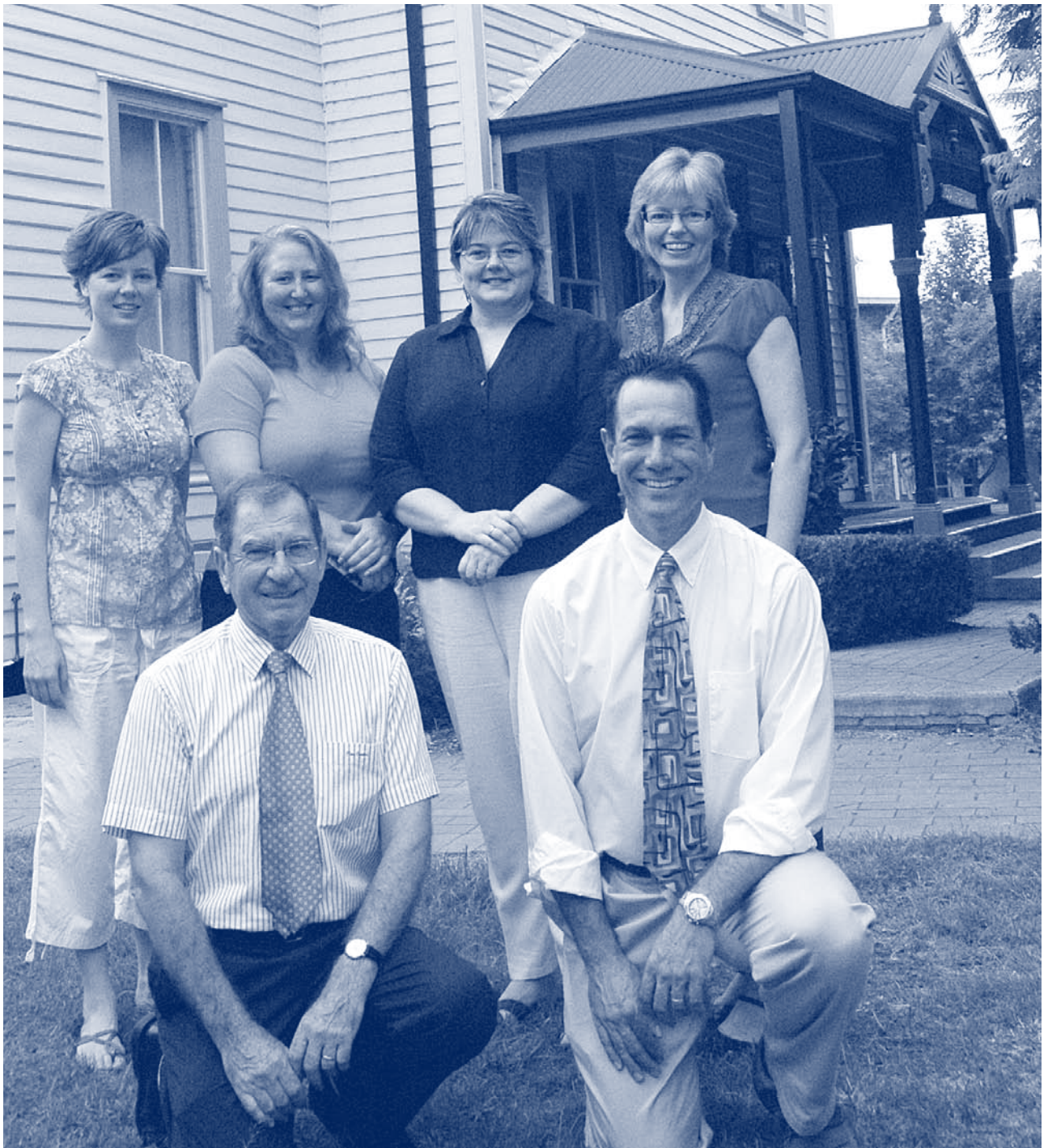
The Avondale College Music Faculty

See pages 15-25 for an historical overview of the music program at AC