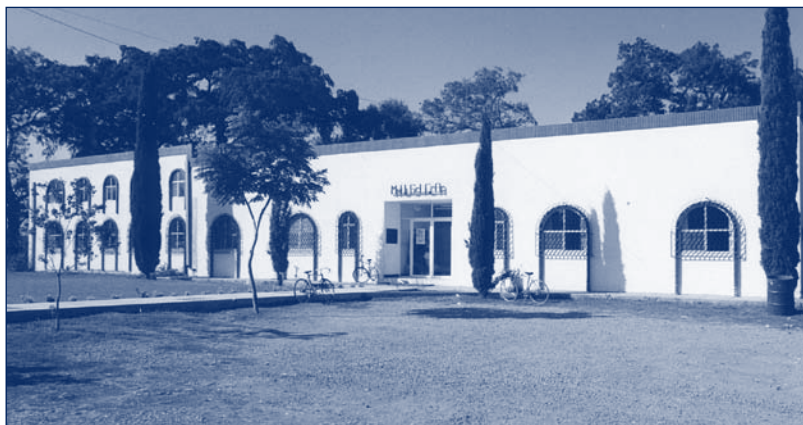
The Music Building at the University of Montemorelos in the 1980s and 1990s

small building with limited seating. In 1981, the music program was relocated to a building constructed for that purpose on the other side of campus.