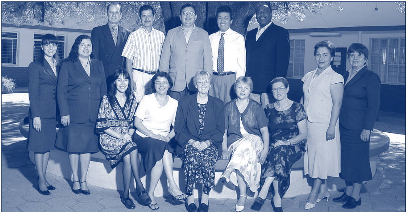
The University of Montemorelos collegiate and conservatory music faculty